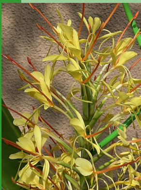
Andrea's Ginger and Crassula

Please bring something from your garden for our horticulture display. It is a delight to see what our members are growing at home. It can be a flower, a fruit or vegetable, a potted plant or greenery. Everyone enjoys a peek into your garden.