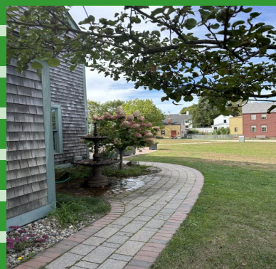
Historic strawberry Banke in New Hampshire