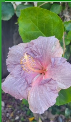
Lori's Lavender Hibiscus