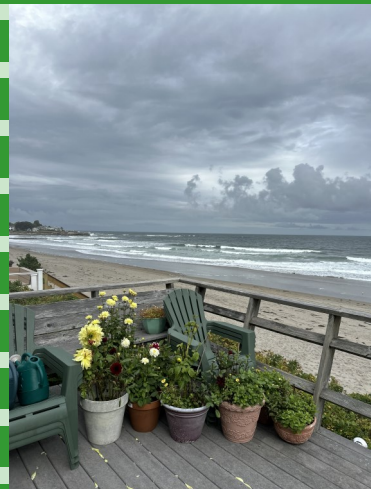
Peggy Colby's backyard in New Hampshire